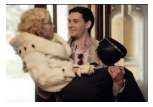
Easy Virtue opens on 7 November and is reviewed on page 56.

"You change and you grow. One moment it's right and another moment it's not right to maintain that policy," she explains. "I'm going to take it project by project now. What makes sense for the character and what makes sense for me..."