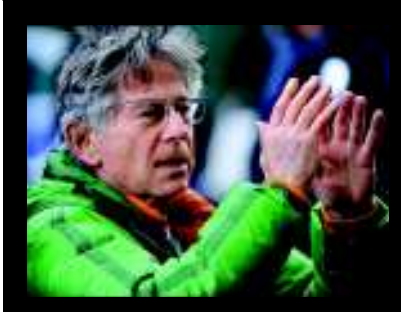
ON SURVIVING THE KRAKOW GHETTO "Believe it or not, I had quite a cool childhood."

ON HIS FAVOURITE OF HIS FILMS "Films are like women. You always love the last most until the next one comes along.