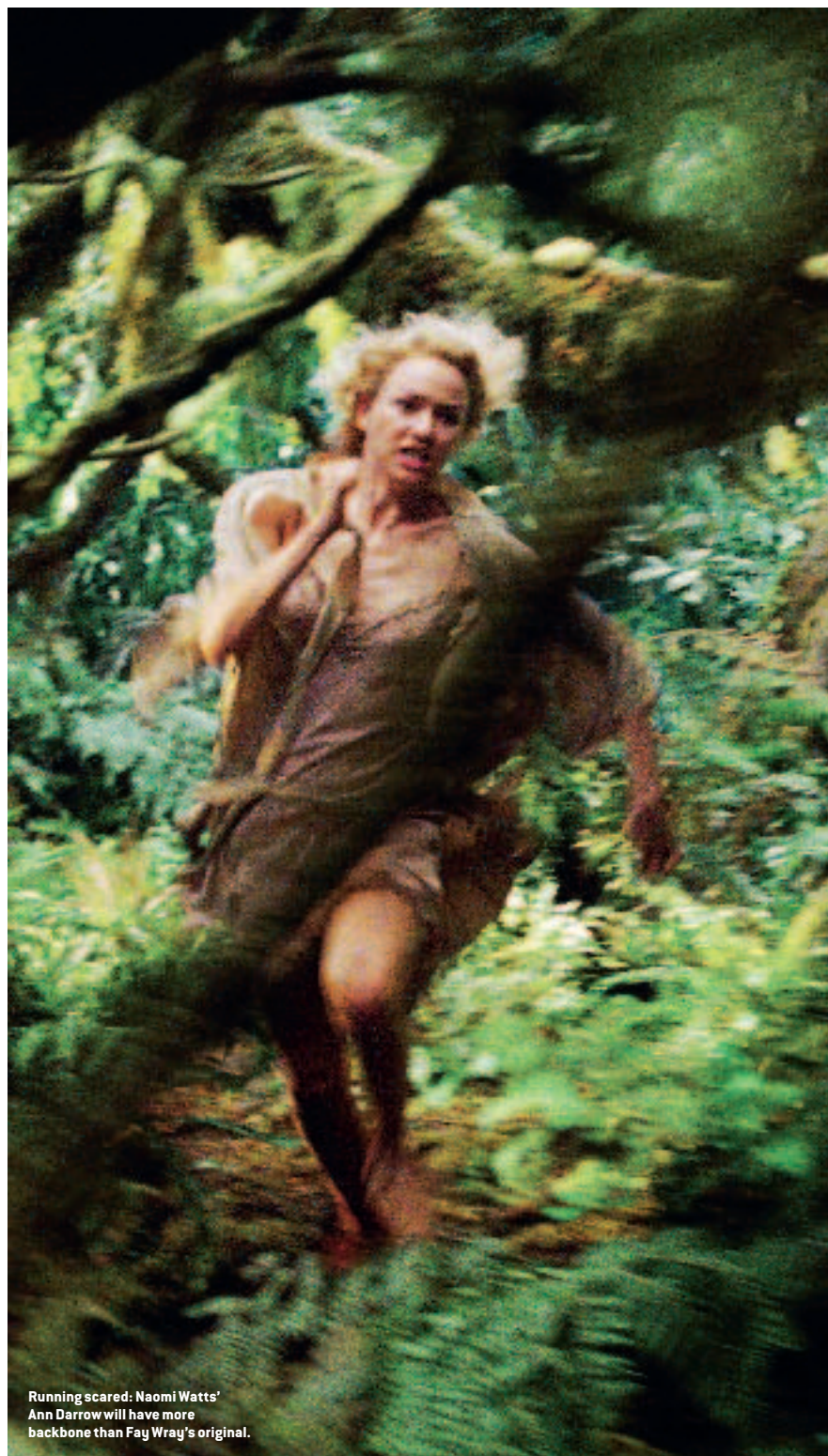
Running scared: Naomi Watts' Ann Darrow will have more backbone than Fay Wray's original.

First up was the pumping trailer, which Kong studio Universal readied in time to swing across the globe with 17,000 prints of War Of The Worlds . It was a tantalising taster that suggested Kong has the potential to deliver on multiple levels – from Jurassic Park -style spectacle to plush period romance. As for Kong himself, he looks the (monkey) business, whether it's snatching a terrified Naomi Watts or bellowing ferociously in the face of a snapping T-rex. Jackson knows the credibility of the big ape is crucial – more important, even, than Gollum to The Lord Of The Rings .