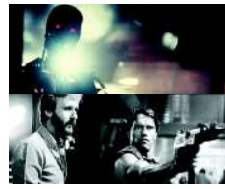
Fight club: (left) becoming the Terminator takes a lot of make-up, and a big gun; (below) Arnie with Cameron and a T-800 on set T1.

Another arena where T <sup>2</sup> shattered glass ceilings was its astonishing soundscape. The score was, says Fiedel, "just slightly different — a bigger, richer sound but still all done with electronics and samples." The way it blended into the on-screen action, however, was revolutionary. "A director friend of mine came up to me after the first screening and said, 'You've broken the line between sound effects and music;" Fiedel says proudly.